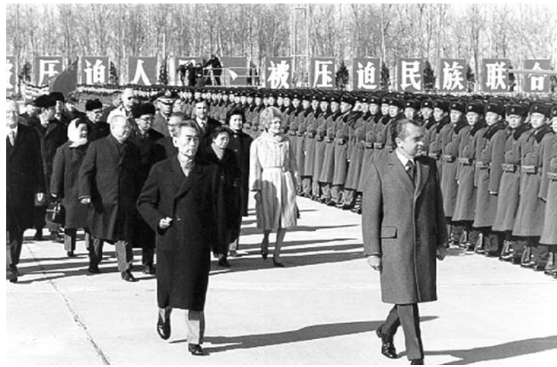
1972 visit in China

Even as the Vietnam War continued, Nixon sought better relations with the People's Republic of China. He relaxed the trade embargo against that country, a move coinciding with the visit there, at China's invitation, of a U.S. table tennis team. In July 1971 Nixon announced that he would visit China. He made the trip in February 1972, was received by Chairman Mao Tse-tung, and conducted lengthy negotiations with Premier Chou En-lai. The talks opened new possibilities for trade and created semiformal channels of communication, short of diplomatic recognition and exchange of ambassadors, between the two countries. The new era in Chinese-American relations reduced tensions and acknowledged a profound alteration in world politics.