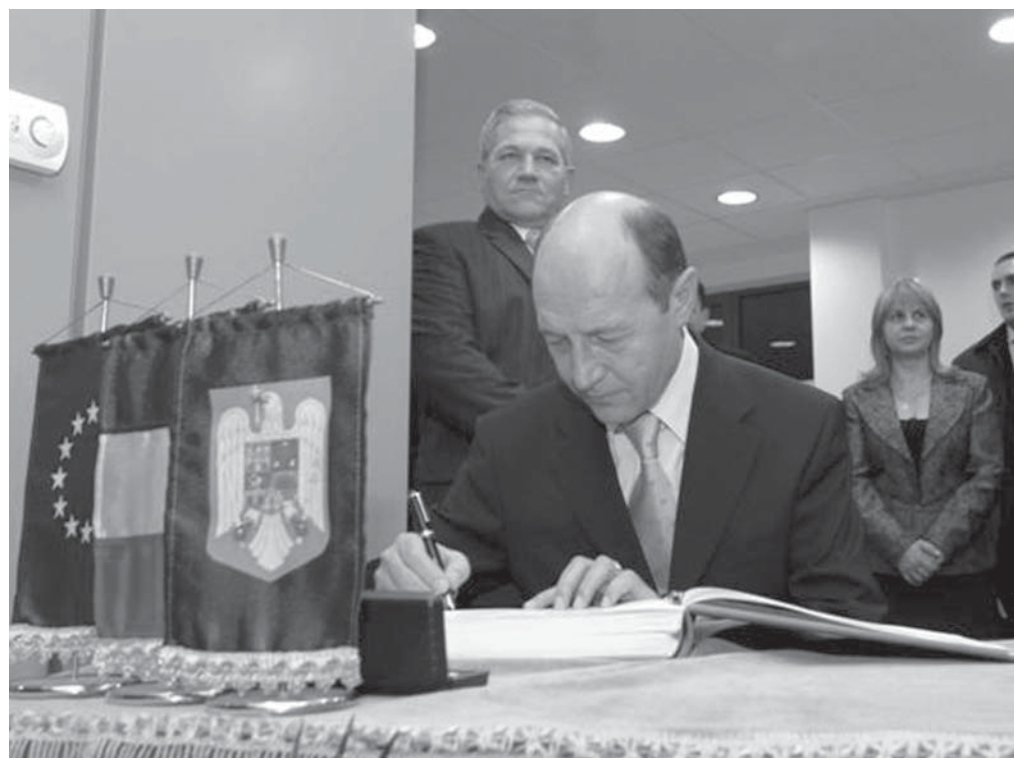
Traian Basescu, President of Romania