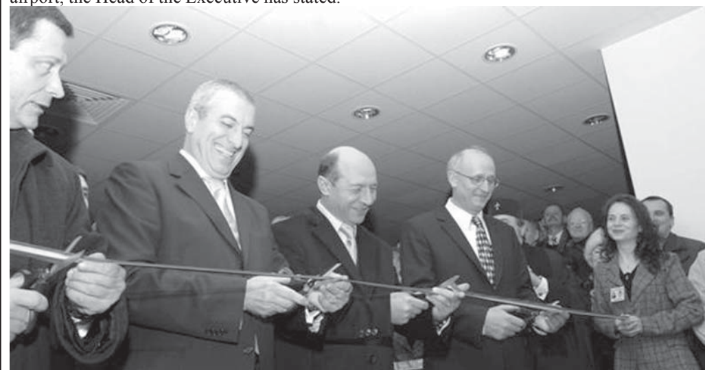
Prime Minister Calin Popescu-Tariceanu and President Traian Basescu at the official launch of the Program "Sibiu - European Capital of Culture 2007"

Government of Romania - Press office - 01.01.2007